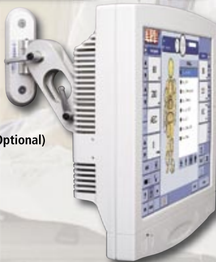
Wall Mount (Optional)