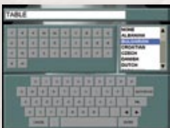
On-Screen Multi-Language Keyboard