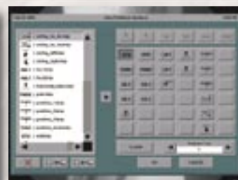
Auto Positioning Set up Screen