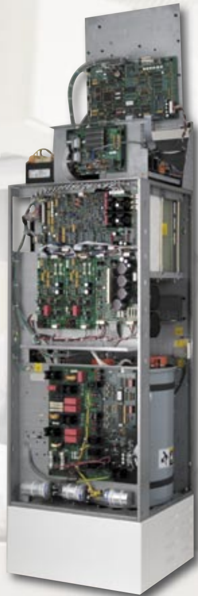
The Indico 100® power supply 'The heart of the CPI system'