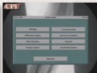
System Utilities Screen